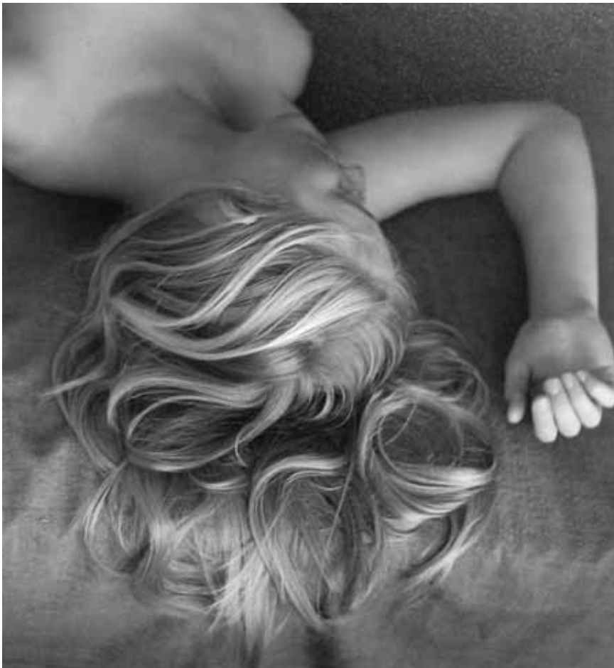
Imogen Cunningham Phoenix Recumbent , 1968 gelatin silver print printed after 1968 and before 1974 10 1/16" x 9 3/16" Boise Art Museum Collection Collectors Forum Purchase