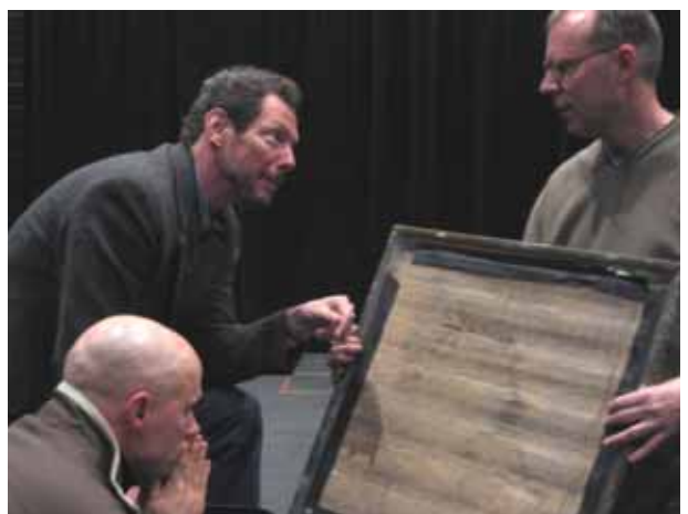
The "Art" actors in rehearsal