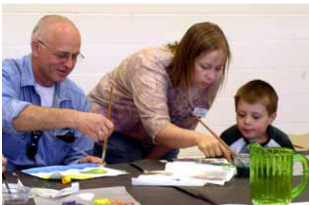
Patrons of all ages enjoy making art in the BAM Studios

Designed for children and adults, BAM's Studio Art Program encourages the creative abilities of all participants by providing experiences in a variety of arts media. All directly relating to BAM's exhibitions, classes ranged from children's classes and camps focused on printmaking, paper making, painting, mixed media portraiture, clay, sculpture, and illustration to