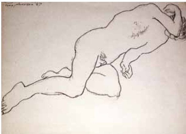
Guy Anderson, Untitled, Male Reclining , 1987 charcoal on paper, 22" x 29 3/4", Boise Art Museum Collection, Gift of Ben and Aileen Krohn

Guy Anderson Untitled, Male Reclining , 1987 charcoal on paper 22" x 29 3/4" 2007.022.001