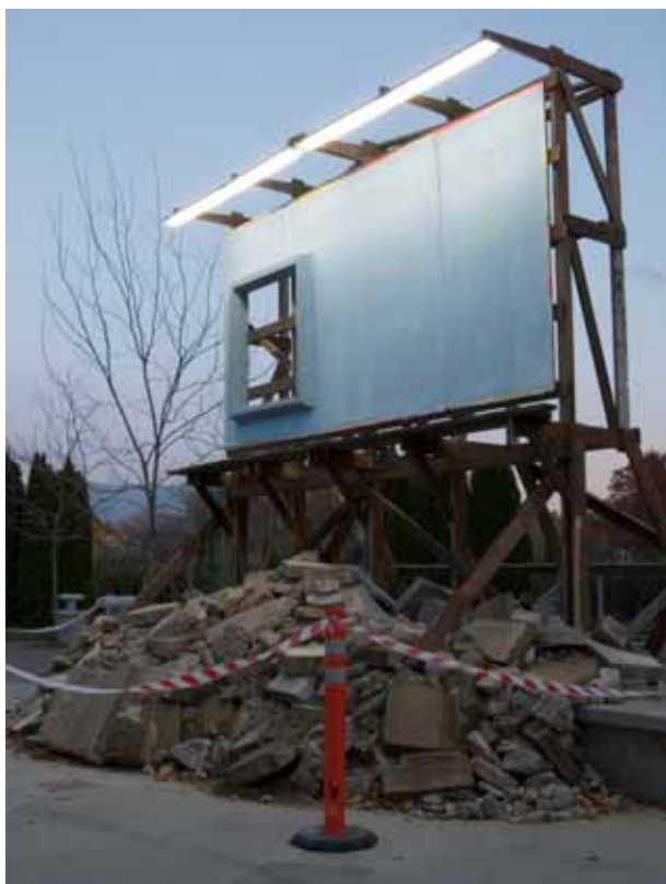
Lead Pencil Studio , Annie Han + Daniel Mihalyo: After BAM Sculpture Garden installation, 2008, the initial exhibition project in the Threads of Perception series

The original grant request proposed a new four-exhibition series entitled Threads of Perception , featuring artists who are internationally recognized for their innovative use of artistic media and their exploration of issues related to human perception.