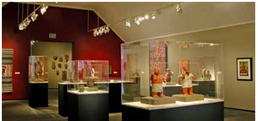
Las Artes de Mexico installation view, Boise Art Museum

Boise Weekly Idaho Media Corporation KTVB Idaho's NewsChannel 7