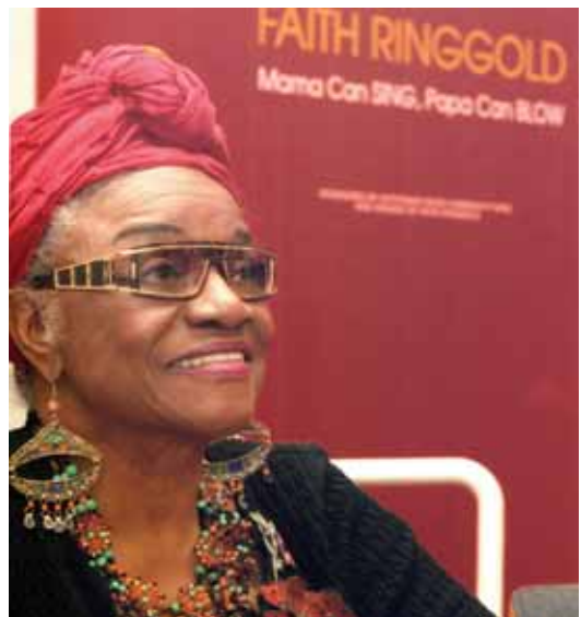
Faith Ringgold at BAM book signing

In conjunction with the exhibition Faith Ringgold: Mama Can Sing, Papa Can Blow , internationally known African-American artist, writer and educator Faith Ringgold presented a special program on March 6, 2008, entitled Faith Ringgold: Story Quilts and Children's Books . The program, held at the Egyptian Theatre, was attended by 325 people, and was followed by a book signing at the Boise Art Museum. As an