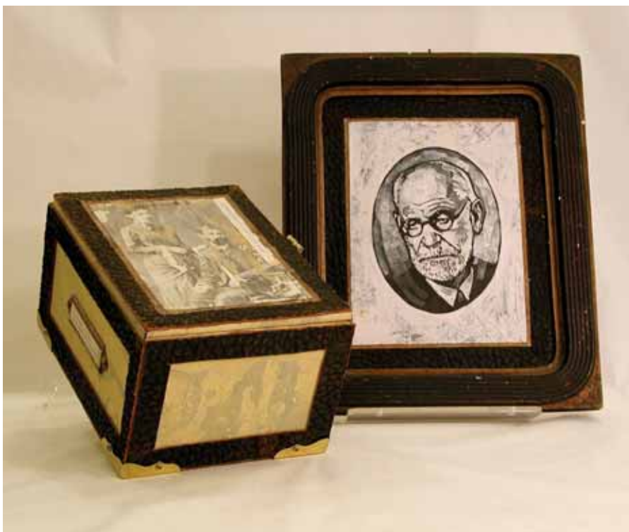
Friese Undine, Liegt Mir in Herzen , 1998, mixed media construction 12 1/4" x 10 1/2"; 6" x 8" x 4 3/4" Boise Art Museum Collection Gift of Ben and Aileen Krohn

René Rickabaugh Huddle , 2007 watercolor on paper 6 1/16" x 7 15/16" 2008.007.001