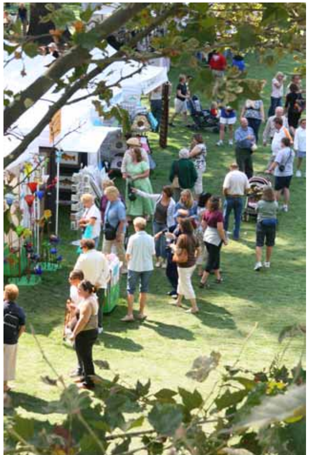
Visitors enjoy Art in the Park