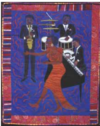
Faith Ringgold, Jazz Stories 2004: Mama Can Sing, Papa Can Blow #6: I'm Leavin in the Mornin, 2004 Acrylic on canvas with pieced border, 82 x 65" Courtesy of ACA Galleries New York, NY