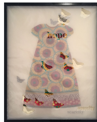
Sally Graves Machlis and Delphine Keim, Sisters in Migration: Syria, Mexico, Guatemala, Ghana , 2019, acrylic and ink on paper, laser-cut silk, 28" x 22" x 2".

Perhaps you are inspired by animals, and want to creatively share a message about the ways animals are important to our planet and lives. Or, maybe, you are inspired by firefighters and the work they do to keep our communities safe.