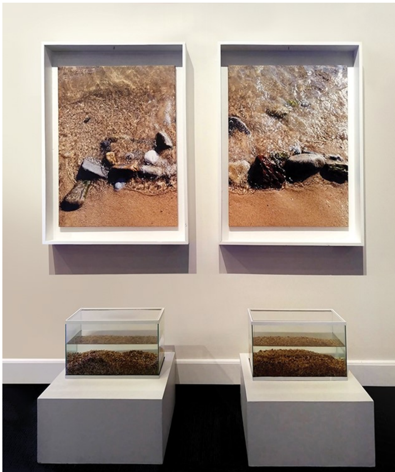
Milica Popović, (Serbian/American, born Serbia, 1966), The Sea Substance (diptych), 2017/2018, mixed-media installation, 49" x 36" x 5.5" box, 20" x 12" x 10" aquarium.