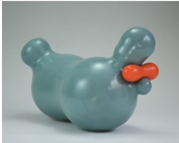
Caroline Earley, Stasis VII , 2019, ceramic, 7x10x5.5

relating to general ideas or qualities rather than specific people, things, or actions