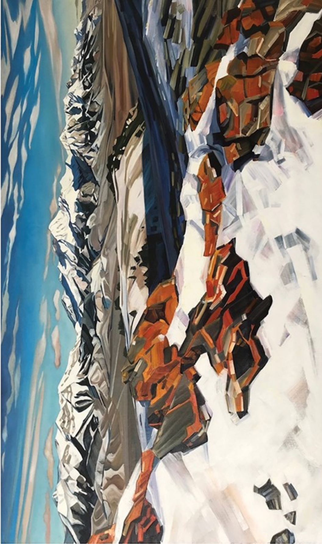
Rachel Teannalach Double Spring Pass and Mount Borah 2019 oil and wax on linen 47" x 78" x 2"