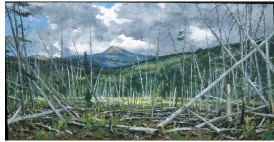
James Cook, Windfalls - Old Fire Site , 1988, oil on canvas, 36x70

Perhaps this artwork is a little of both—it is realistic, but has an abstract style .