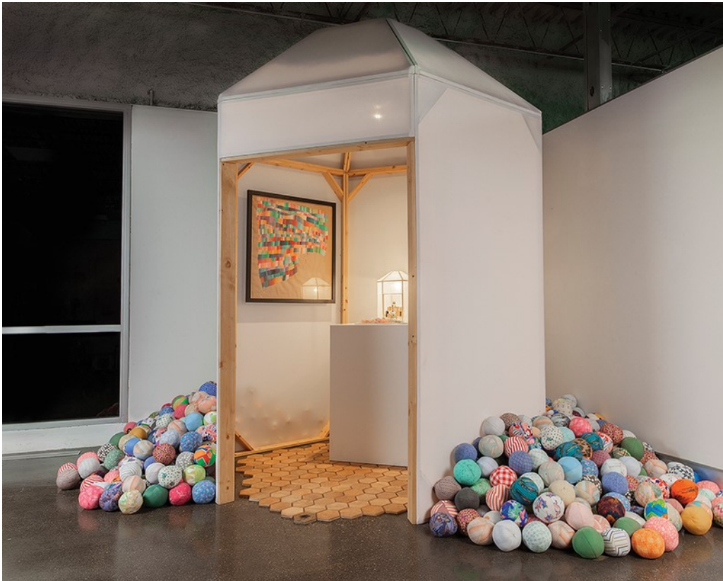
(detail images, pg. 4-6)